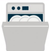
load / unload the dishwasher

clean my bedroom iron load / unload the dishwasher do the laundry set / clear the table make my bed do the vacuuming cook meals take out the trash feed the dog do the dishes clean the bathroom